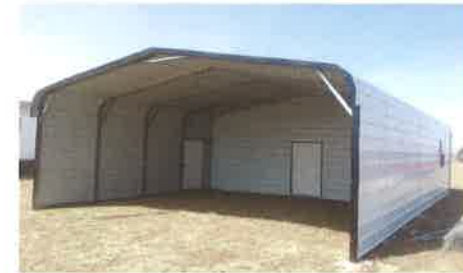
Standard utility carport, 10' Enclosed & 1- walk in door & window on side