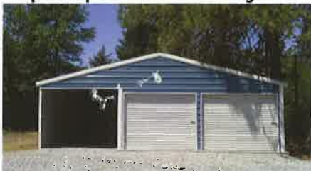
Triple Wide Warehouse