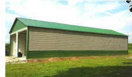
A-Frame Vertical Roof garage, with NEW Colonial TRIM and Residential Style trim. 2- 9x7 openings on front end