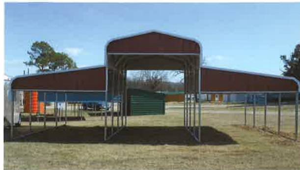
Standard agricultural Barn, with gable ends on front & back