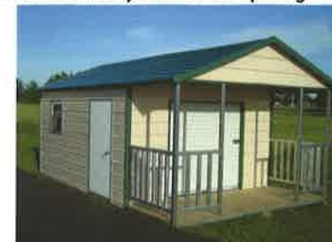
A-Frame Horizontal Mini Storage Unit with Railing