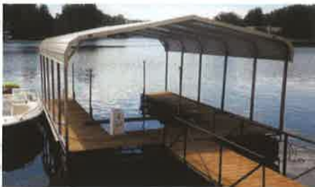
Open Carport Mounts to Existing Dock