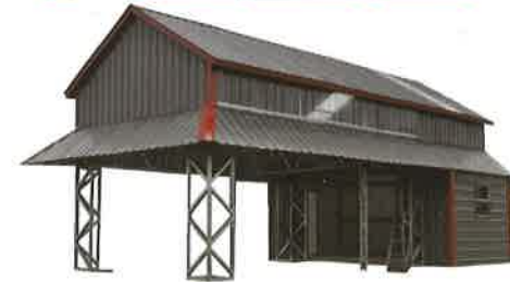
ASCI Custom Buildings