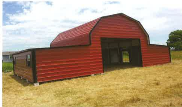
Agricultural hexagon style barn, with 2- 8x7 openings, 4 windows on sides

Our full line of buildings come in a variety of shapes and sizes. Our extensive variety ranges from Open Carports, Partially enclosed Carports, Mini Storage units, Garages, Warehouses and even Portable Hunting Blinds. We can customize your unit to accommodate your steel metal needs. Choose from our Standard Style, A-Frames, Hexagon and Agricultural units. Each building is carefully constructed from 29 gauge steel for the paneling of roof and sides and your choice of 12 or 14 gauge steel tubing for the framework. Each and every building is Engineered-certified to meet your state and local codes. We use steel with a commercially baked on finish to provide years of low maintenance. We offer additional anchors to provide a 90 MPH Wind Warranty to put your mind at ease. Can't find exactly what you need? Give us your specifications and we'll work with you to create the building that matches your requirements. IF YOU CAN IMAGINE IT, WE CAN CREATE IT!!!